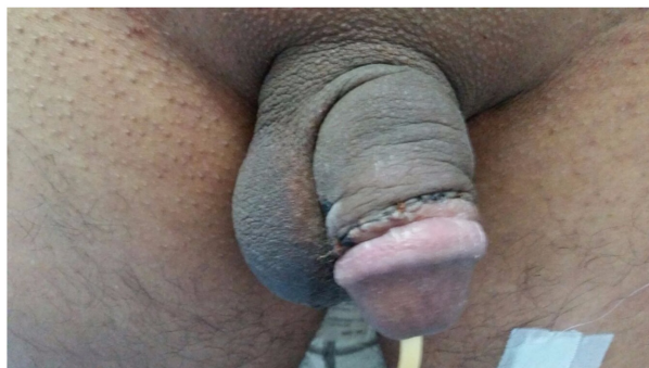
Figure 4. Second post-op day after repair of double penile fracture.

Penile fracture, or faux pas du coit , is an underreported but emergent urological condition 8 . It's underreported because many patients do not seek medical attention due to embarrassment, shame, or lack of guidance 3 . Activities that can result in penile fracture includes self-manipulation to achieve tumescence, sexual intercourse, turning over in bed, a direct blow to the erect penis and interrupting the erection due to a violent bending of their penis called "Taqaandan" 2,4,9 . The most common cause is sexual intercourse, with injuries often caused by different sexual positions. In an original article published in 2017, Barros et al. reported that 'doggy style' was more commonly associated with double fractures out of 67 patients (10%) presented double corpus cavernosum lesión 10 . In fact, any activity associated with tumescence can increase the chance of penile fractures. In 2002, Blake et al. reported the first case of a fracture related to pharmacologically induced erections 11 . The increased risk of penile fractures during tumescence is related to the tunica albuginea stretching and thinning. The thickness of the tunica reduces from 2.4mm, in the flaccid state, to 0.25-0.5mm in the erect form 12 .