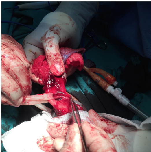
Figure 3. Protection of the urethra during surgery using a Penrose drain through the double fracture.

The penis is composed of erectile tissue arranged in a columnar fashion. Two dorsolateral corpora cavernosa and one ventral corpus spongiosum, each enclosed by the tunica albuginea. The urethra traverse the corpus spongiosum throughout its length. The distal expansion of the corpus spongiosum forms the glans penis. Buck's fascia encloses the corpus spongiosum ventrally, and splits dorsally to surround the two corpora cavernosa 1,4,5 .