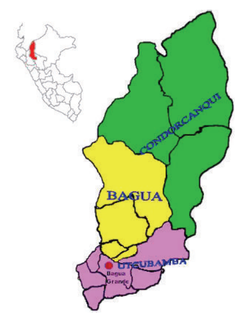
FIGURE 2: Location of the sampled areas in Bagua Grande (red spot), province of Utcubamba, department of Amazonas, Peru. At left top, map of Peru with location of department (filled in red).

The Miraflores group (prevalence of acute form) consisted of 36 individuals, 14 males (38.9%) and 22 females