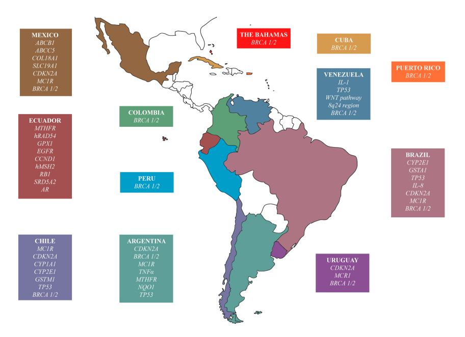
Figure 2. Cancer associated genes studied by country in Latin America.

All these researches have determined the association of different genetic variants with the highest risk to develop different types of cancer in the Latin American populations. These results allow the understanding of the genome both at population and individual level in the best possible manner turning this a relevant step for the development (Table 2) (Figure 2).