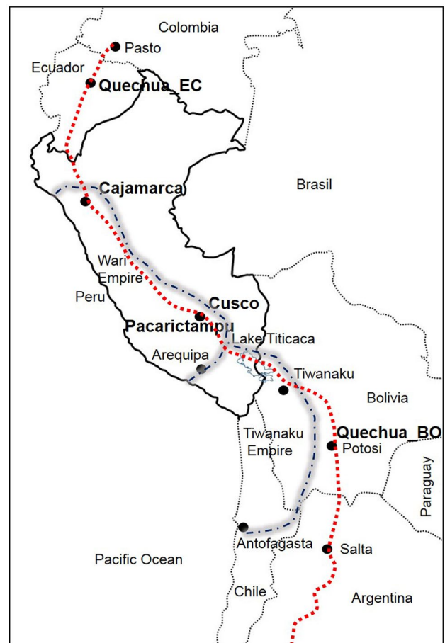
Fig. 1 Map showing the reference locations of samples investigated in this study. Dashed lines that cross from Pasto to Peru, Bolivia and Argentina indicate a part of the ‘backbone’ of Qhapaq Ñan (Great Inka Road). Dashed and dotted lines show the geographical extension of the Wari and Tiwanaku Empires

The initial patrilineal analysis involved genotyping five Y-SNPs identified in South American natives, including M130, M242, M346, L54 and M3, using TaqMan assays (ABI) and a 7900HT Fast Real-Time PCR System (ABI), and 17 Y-STRs (Karafet et al. 2008; Jota et al. 2011). Subsequently,